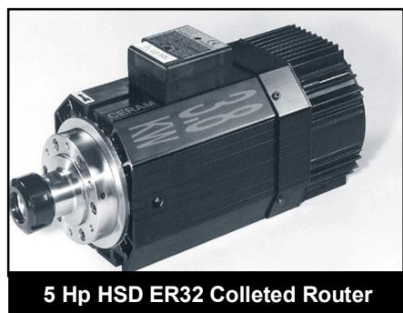
5 Hp HSD ER32 Colleted Router