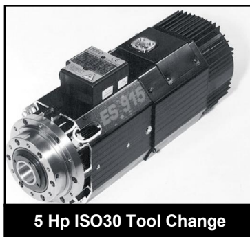
5 Hp ISO30 Tool Change

1600 William Flinn Highway Glenshaw, PA 15116 412-244-5770 www.cntmotion.com